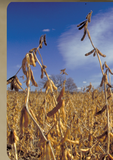
Soybeans ready to harvest

Soybeans are an increasingly important commodity in North Dakota; ranking third behind spring wheat as the state's top cash crop. Cass County in eastern North Dakota is the number three soybean growing county in the nation.