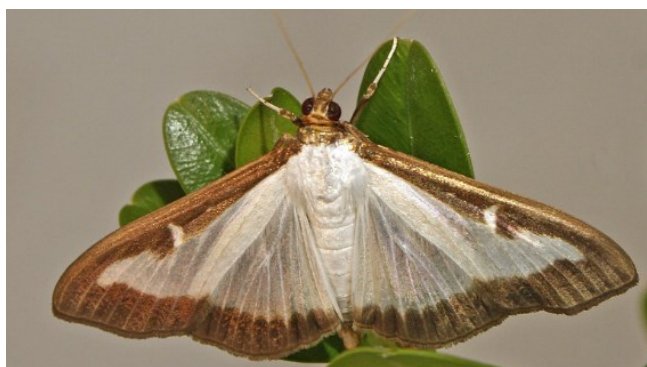
Box tree moth (above), larva (below)

In May 2021, regulations were put in place prohibiting the imports of boxwood ( Buxus spp.), holly ( Ilex spp.), and Euonymus ( Euonymus spp.). These are considered a high-risk pathway for the introduction of boxtree moth (BTM). BTM is a significant pest of boxwood. It can quickly defoliate boxwood plants, eventually feeding on the stems and killing the plants. BTM was confirmed in Niagara County, New York, in July 2021 and a quarantine was established. It is likely that BTM spread naturally across the river into New York from Canada. In September 2021, regulations were established creating additional steps to the importation of strawberries ( Fragaria spp.), raspberries ( Rubus spp.), blackberries ( Rubus spp.), and roses ( Rosa