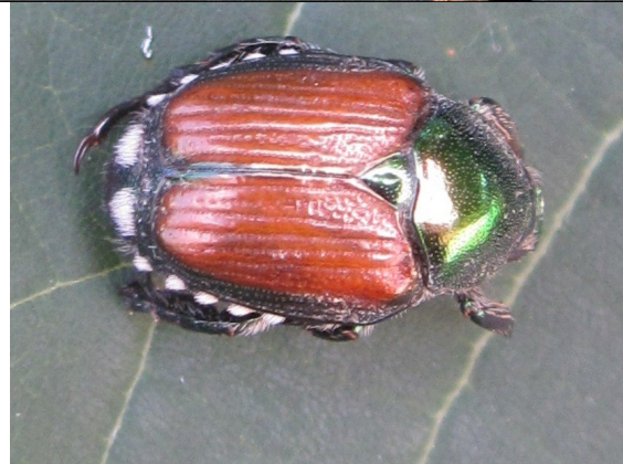
Adult Japanese beetle