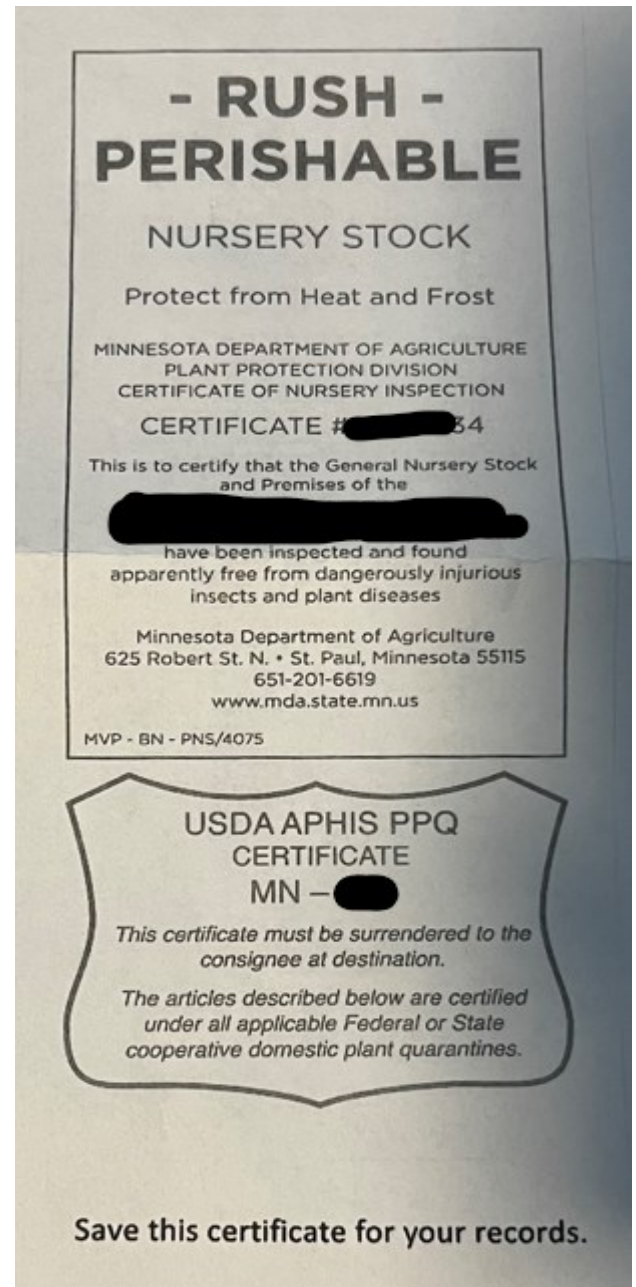
Example of certification documentation.

Plants not labeled ... at all – All nursery stock for sale and available to the consumer must