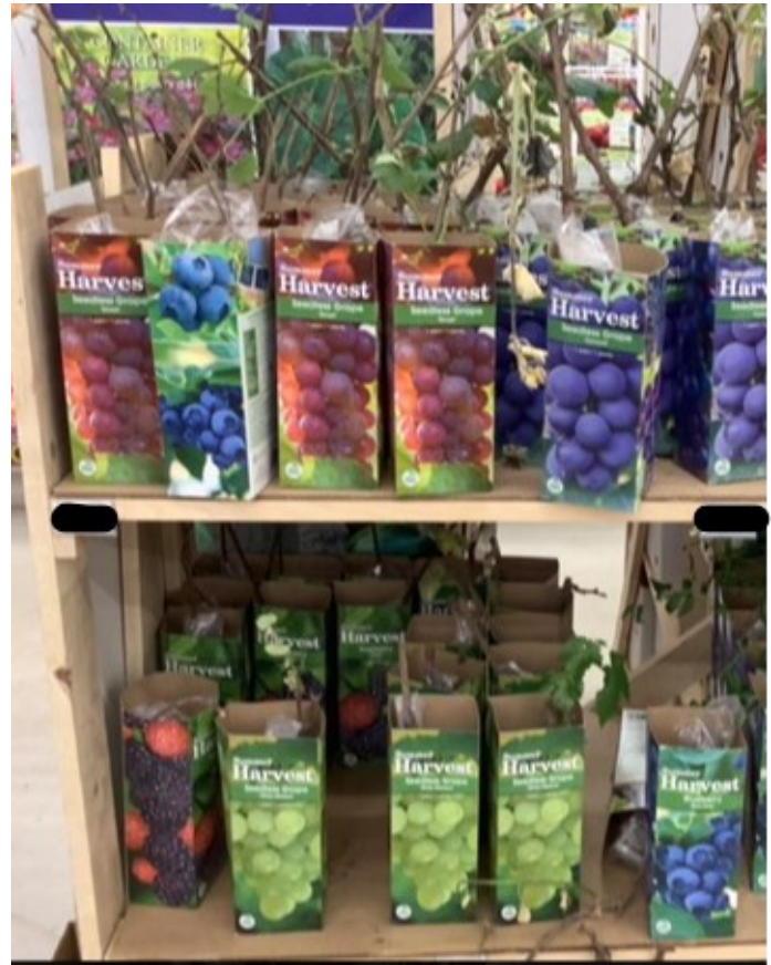
Improperly stored, actively growing, bareroot, prepackaged nursery stock.

While these are the most common violations, there are other things in nursery law and regulations that are worth paying attention to. There are