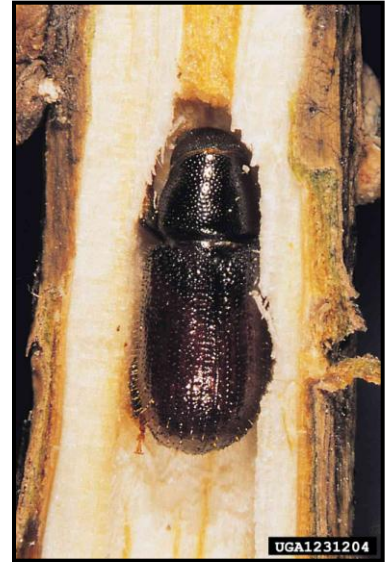
Adult boring through shoot

Damage – Infested shoots wilt at the entrance point of the adult beetle, turning yellow to red. The infested shoots eventually fall to the ground. High levels of shoot feeding can reduce growth. Blue stain fungi has been associated with larval feeding in logs.