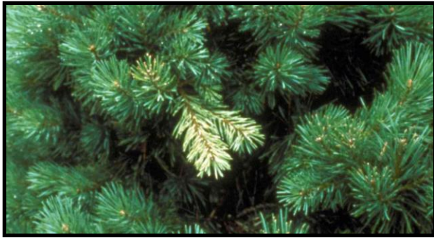
Damage caused by adult feeding