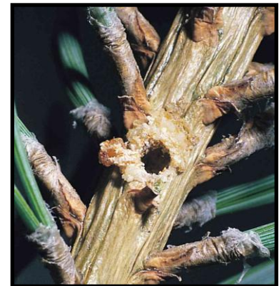
Entrance hole of adult in shoot

Closely inspect and monitor all nursery stock and Christmas trees received from quarantine areas and ensure shipments are accompanied by a federal certificate or stamp demonstrating quarantine compliance.