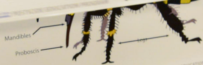
Diagram of an Insect